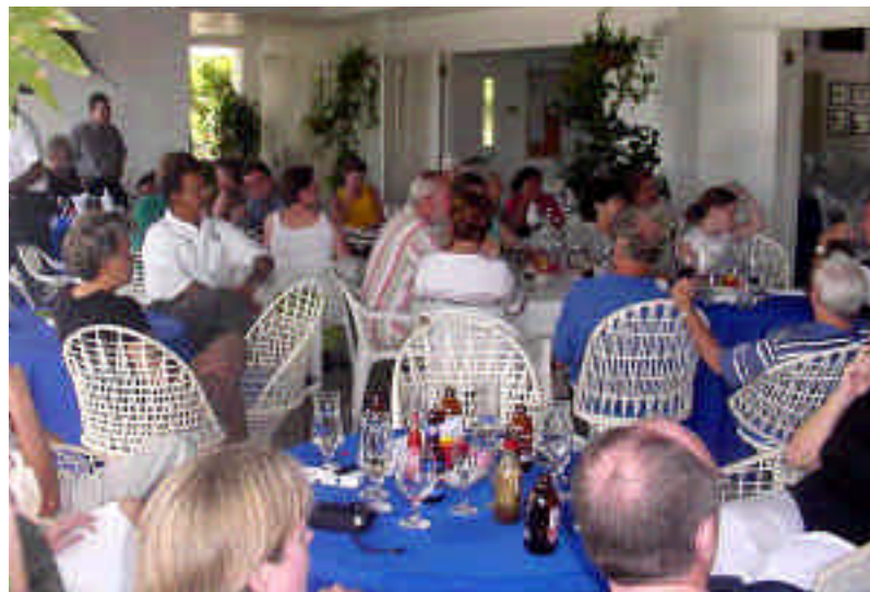
Section of the crowd at The Awards Brunch