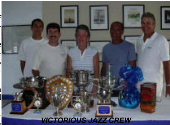
VICTORIOUS JAZZ CREW