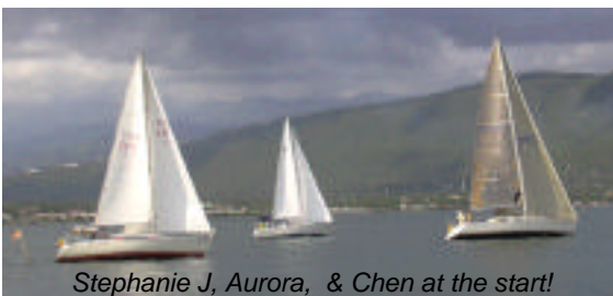
Stephanie J, Aurora, & Chen at the start!

- attracted some 40 members for what turned out to be pleasant evening. The food was good - Fried Fish or Chicken and the Moon rose on cue for the start of the "Race" at 21:15hrs. Five boats started plus a power boat as Patrick Sleem cruised his new toy on what seemed to be a champagne harbour cruise. The sail boats did not complete the course in time as the wind went